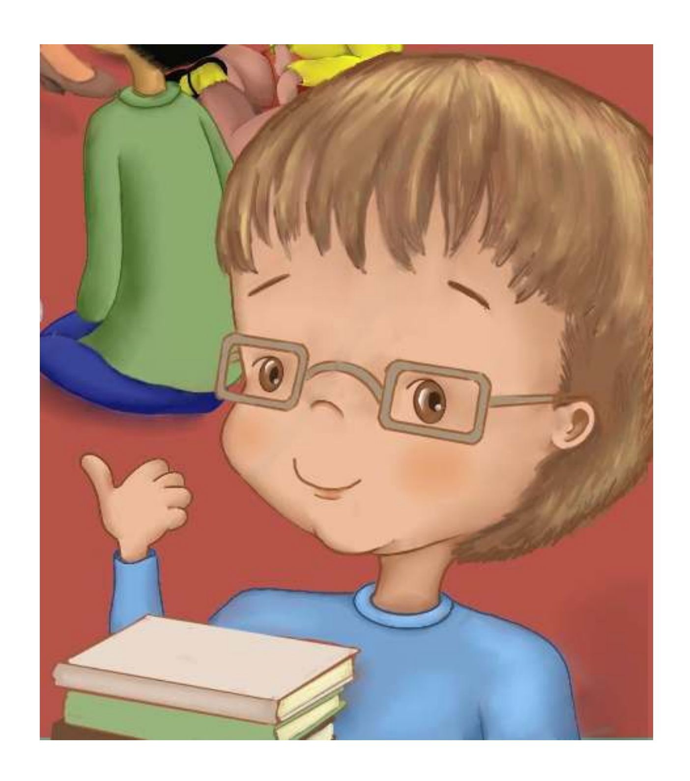
KIDS DID IT!